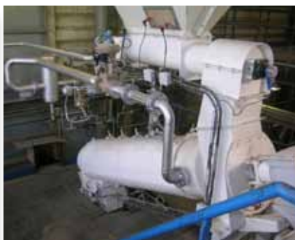
Super conditioner with steam injection