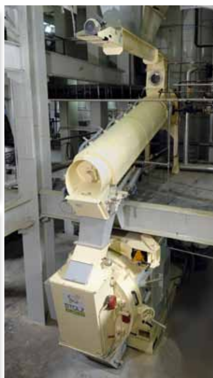
Super conditioner upstream a pellet mill