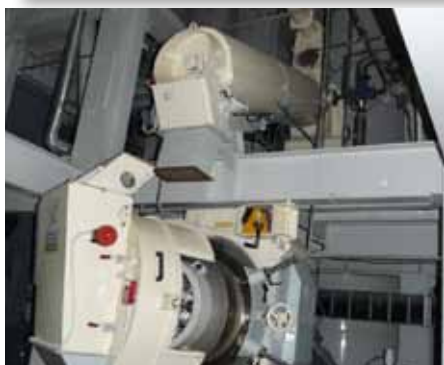
Super conditioner in pellet mill preparation