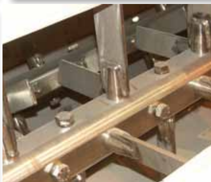
Rotors detail on CPID 700