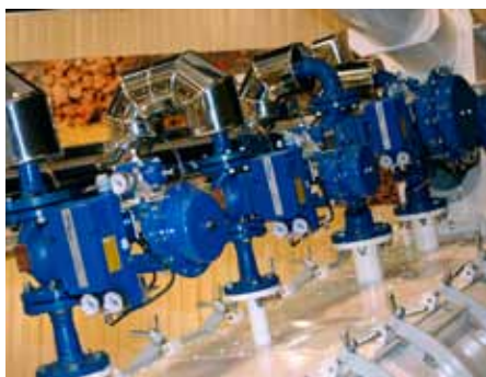
Steam unit on CPID 700

The outlet valve is designed for a regular feeding, and a quick response time of the pellet mill. It is designed to be cleaned easily and to avoid any leak-off steam leak.