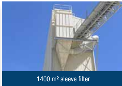
1400 m 2 sleeve filter