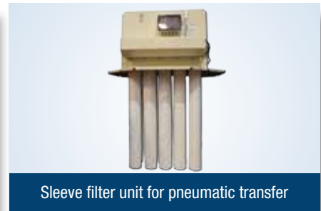
Sleeve filter unit for pneumatic transfer