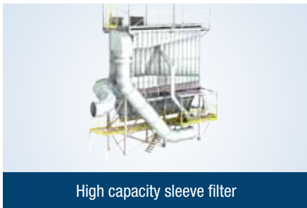
High capacity sleeve filter