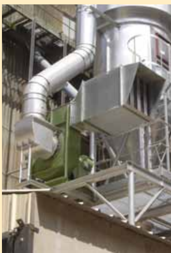
Galvanized cyclofilter with sleeves

The advantage of the cyclonic effect is a pre-separation of the biggest particles that could damage the sleeves.